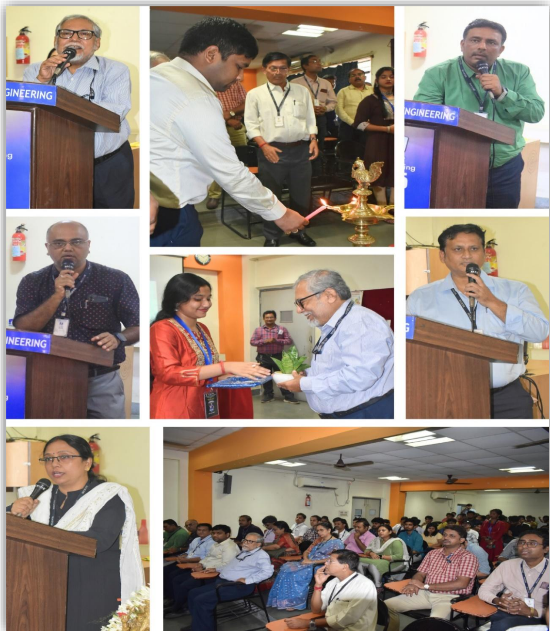
Inauguration Ceremony at B – 312 (B Block)