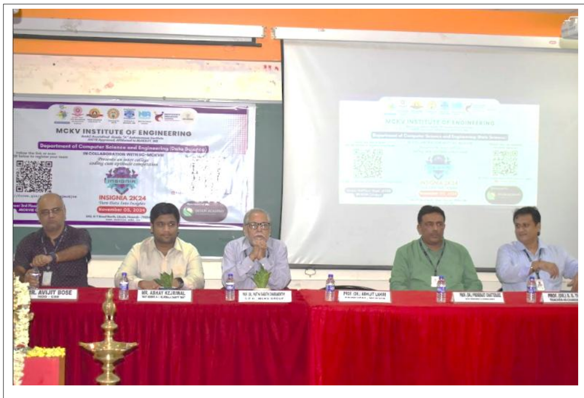
Dignitaries in the Inauguration Ceremony

This ritual is followed by the addresses of dignitaries to the audience. The inauguration program was hosted in an elegant way by the student anchors.