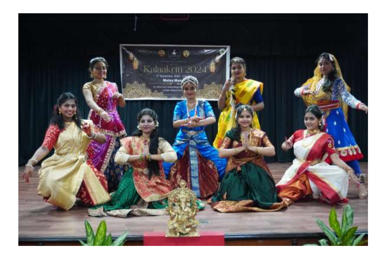
Dance Sequence Representing different Indian Festivals