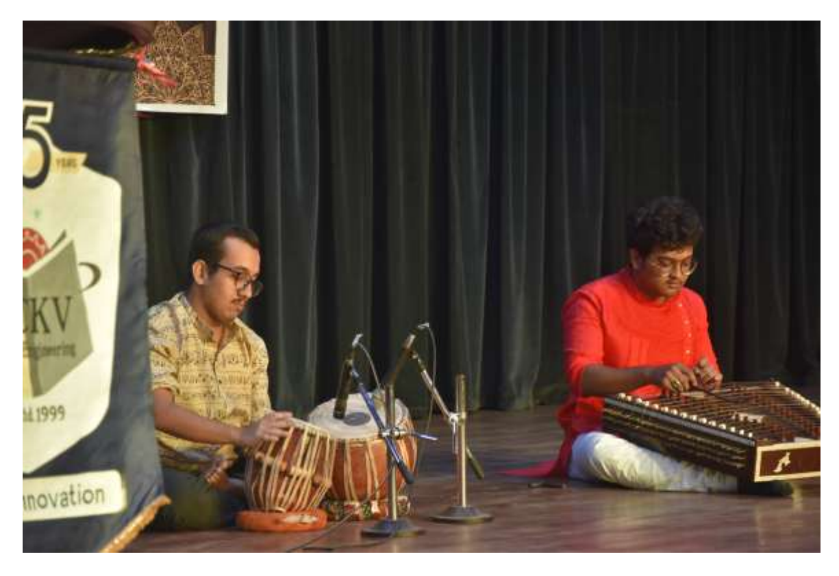
Performance on Indian Classical Music Instruments